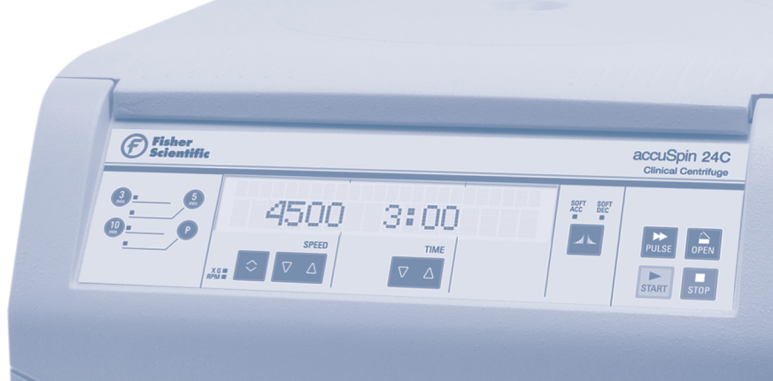
Figure 1. Fisher Scientific accuSpin 24C Centrifuge.