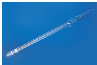
PYREX® Ostwald-Folin blood chemistry pipets must be carefully cleaned to ensure their accuracy.

After use, rinse thoroughly with cool tap water, distilled water, alcohol or acetone, and then either.