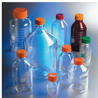
Corning offers a full selection of both reusable and disposable PYREX glass and plastic storage bottles designed to meet the stringent requirements of cell culture.

In laboratories where a large number of pipets are used daily, it is convenient to use an automatic pipet washer. Some of these, made of metal, are quite elaborate and can be connected directly by permanent fixtures to the hot and cold water supplies. Others, such as those made