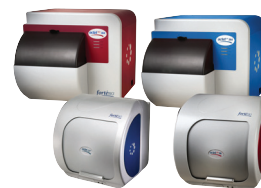
The Octet® Platform

Octet Systems with Dip and Read assays. No hassle, label-free ELISAs.