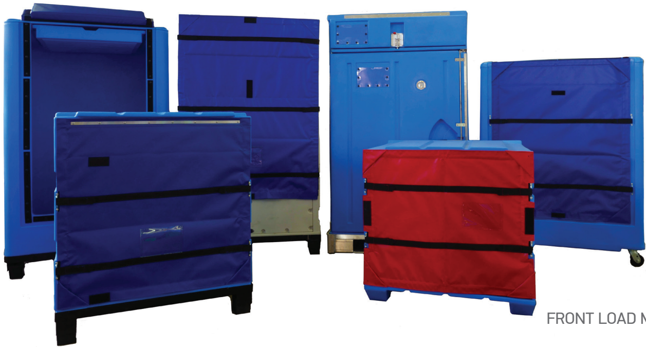
FRONT LOAD MODELS

ThermoSafe chests and containers are strong, durable, and specifically manufactured to be used and reused. Replacement latches, hinges, handles, and other handling and replacement accessories are available at a low cost. Contact your Fisher Scientific Account Manager for more information.