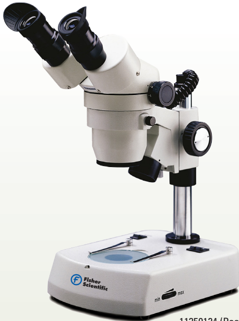
11350124 (Post Stand)

This series of zoom stereo microscopes offers the convenience and versatility of viewing items at 10X magnification then zoom continuously to maximum detail at 40X magnification...or at any point in between. The upright, unreversed image remains in focus throughout the zoom range. Available in binocular or trinocular head types. The trinocular head features a port to accept optional video C-mount and SLR camera adapters (included). This series is also available in three base configurations: post mount, platform, or boom stand.