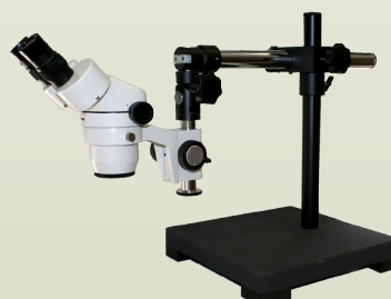
11350126 (Boom Stand)