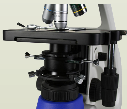
Condenser with phase slider installed