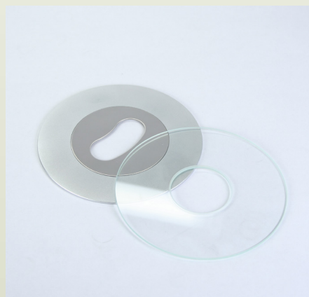
Metal and glass stage insert