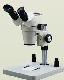
11350128 (Platform Stand)