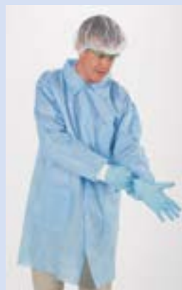
Medical Blue Lab Coats