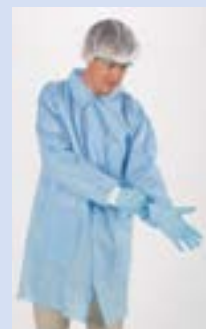
Medical Blue Lab Coat