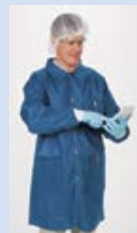
Navy Blue Lab Coat