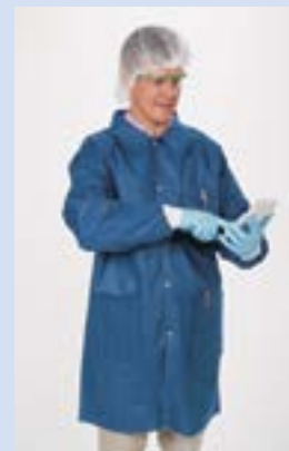
Blueberry Lab Coats