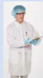
White Lab Coat