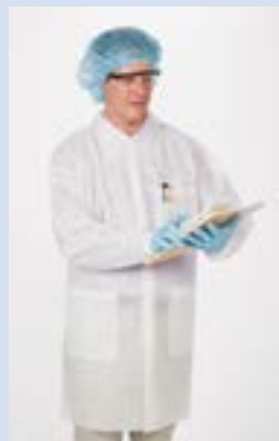
White Lab Coats