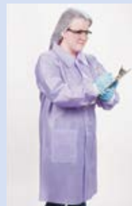
Purple Lab Coats