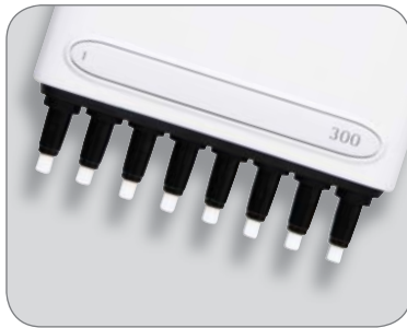
Safe-Cone Filters protect the pipette from contamination.

The exchangeable Safe-Cone Filters, used in pipette tip cones, act as barriers to prevent sample aerosols and fluids from contaminating the internal components of the pipette.