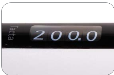
The volume is easy to read even when the pipette is angled.

The large, easy-to-read display helps you to see all four digits of the set volume from a distance without straining your eyes. The volume is easy to read even when the pipette is angled – eliminating the need to turn your head into an uncomfortable position.