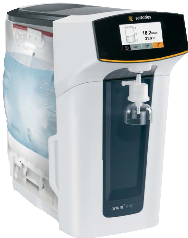
Exemplary representation with open side cover

arium® mini – unique quality “Made in Germany”