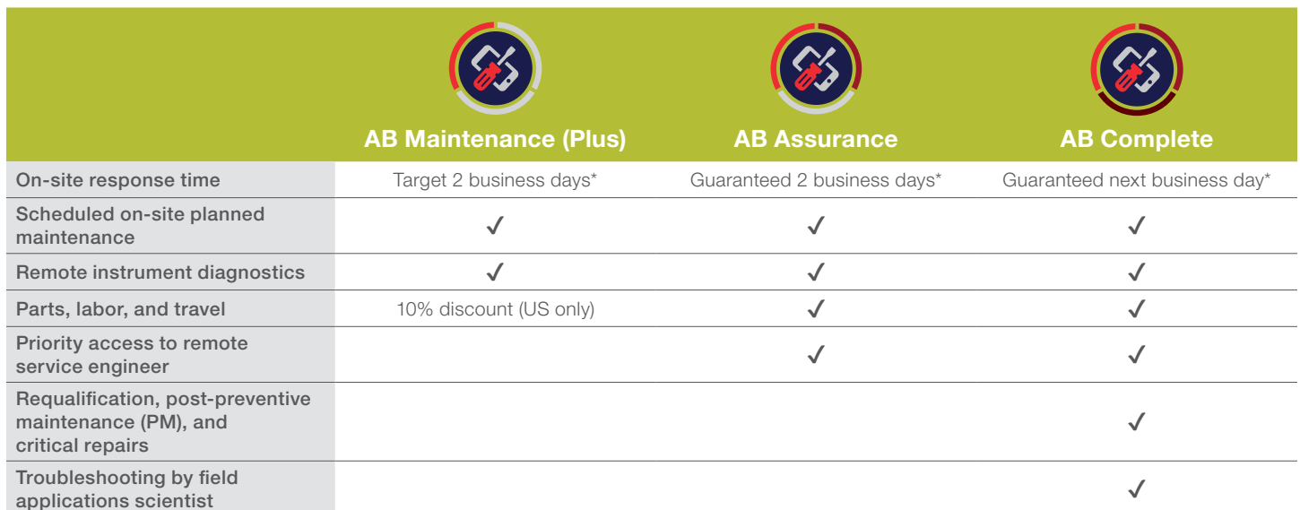
Table 1. Service plans at a glance.