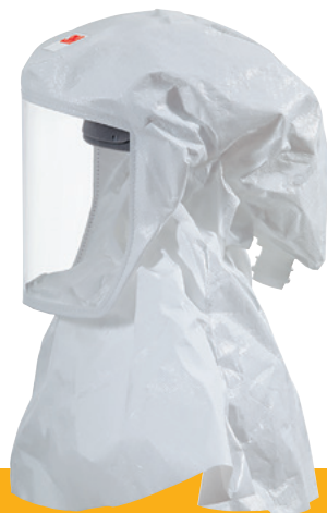
3M™ Versaflo™ Headcover S-433

Head and face coverage. Integrated comfort suspension. General purpose fabric.