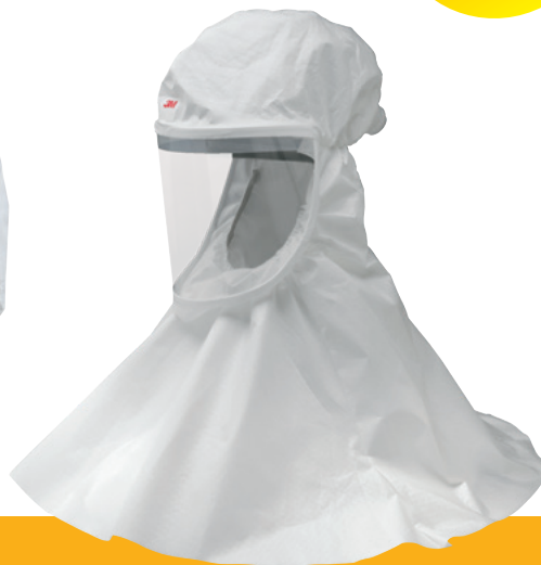
3M™ Versaflo™ Economy Hood S-403

Head, face, neck and shoulder coverage. Integrated suspension.