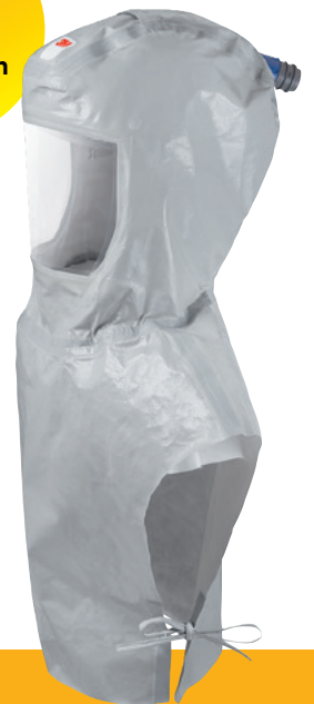
3M™ Versaflo™ Hood S-857

Head, face, neck, and shoulder coverage. Fabric suspension, inner shroud.