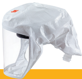
3M™ Versaflo™ Headcover S-133

Head and face coverage. Integrated comfort suspension. General purpose fabric.