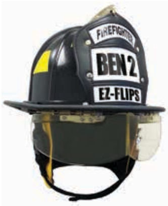
Ben 2 LR Traditional Helmet