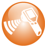
THERMAL IMAGING AND DETECTION