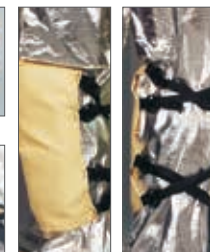
Strap-on training knees