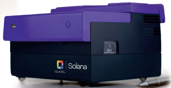
Solana Strep Complete Assay run with the Solana benchtop instrument a mere 9.4" x 9.4" x 5.9"

The Accurate. Sustainable. Molecular Strep Solution.