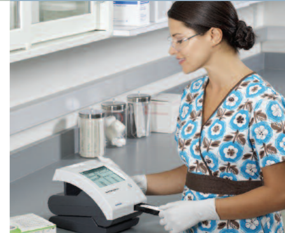
Automated hCG pregnancy testing

Siemens leads the way in urinalysis testing with world-class service